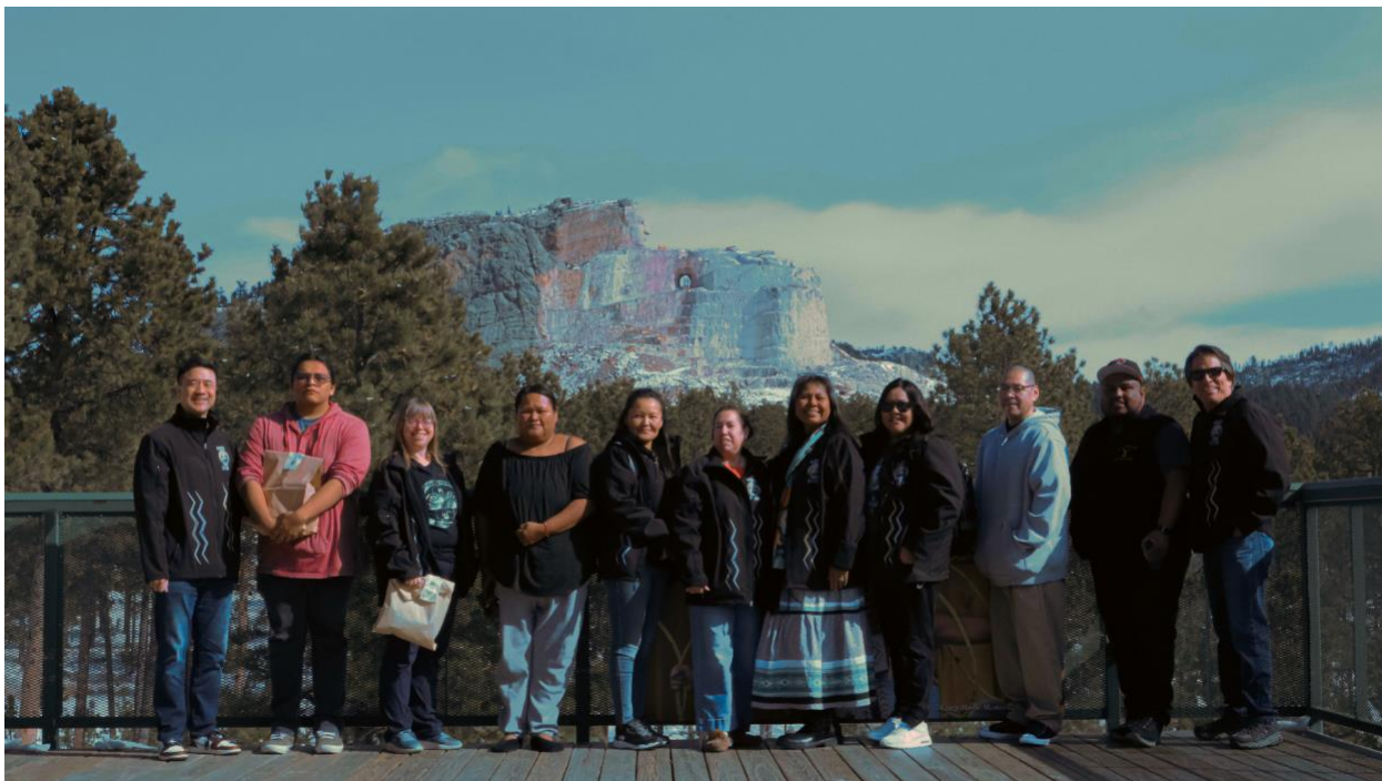
SCAC AIHEC Team at the Crazy Horse Memorial, during the 2025 Student Conference

AIHEC provides many unique opportunities to TOCC/SCAC students to learn, grow, and develop in special ways. For example, SCAC, like all other members of AIHEC, can select one or more students to accompany College administrators and Regents to the AIHEC winter meetings in Washington, D.C., where they can witness or learn about the nation’s legislative process, as well as help champion their college to congressional leaders and federal government officials. Also, each spring several SCAC students travel to the AIHEC student conference, a gathering of student representatives from tribal colleges and universities throughout the country, where they participate in various academic and sports competitions with students from other TCUs.